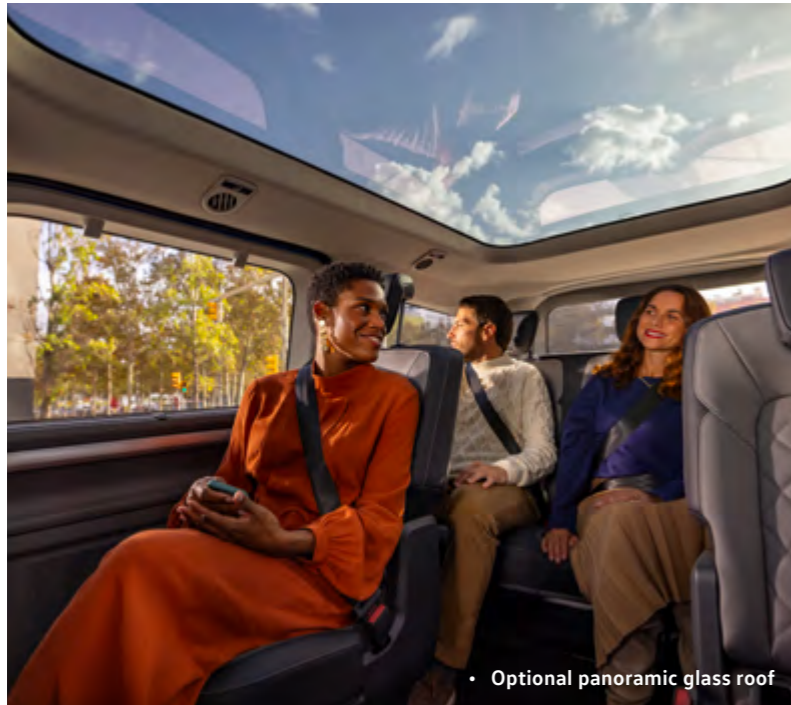
• Optional panoramic glass roof