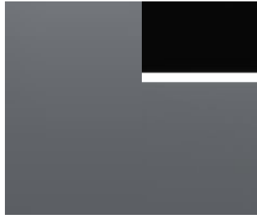
Moonstone Grey Solid C2C2 / C2A1