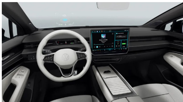
Mistral / Soul Black / Grey Detail / White Steering Wheel (AK) Optional from ID.7 PRO PLUS / PRO S PLUS (forces option package PBF)