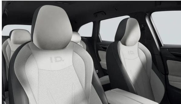
Inserts of front seats and outer rear seats in perforated ArtVelours ECO microfleece, seat bolsters in Artex Mistral / Soul Black (ZP) (forces option package PBF) Optional from ID.7 PRO PLUS / PRO S PLUS