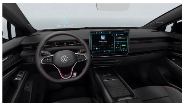
Soul Black - Red (ZQ) Standard from ID.7 GTX PLUS

Note: The print processes do not allow exact reproduction of the upholstery & insert colours.