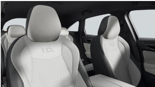
Inserts of front seats and outer rear seats in perforated ArtVelours ECO microfleece, seat bolsters in Artex Mistral / Soul Black / White Steering Wheel (AK) (forces option package PBF) Optional from ID.7 PRO PLUS / PRO S PLUS