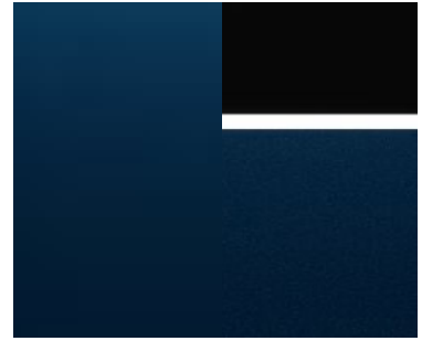
Aquamarine Blue Metallic 8H8H / 8HA1