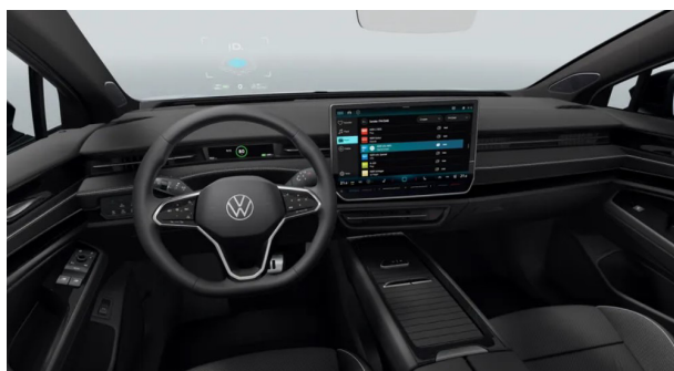
Soul Black (ZO) Optional from ID.7 PRO PLUS / PRO S PLUS (forces option package PBF)