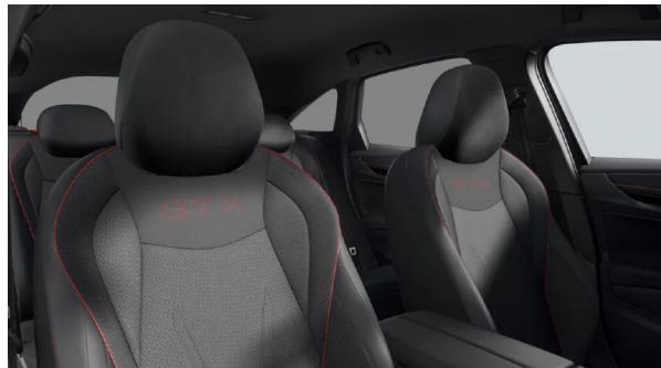
Inserts of front seats and outer rear seats in perforated ArtVelours ECO microfleece, seat bolsters in Artex (GTX) Soul Black - Red (ZQ) Standard from ID.7 GTX PLUS

Note: The print processes do not allow exact reproduction of the upholstery & insert colours.