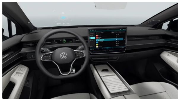
Mistral / Soul Black (ZP) Optional from ID.7 PRO PLUS / PRO S PLUS (forces option package PBF)