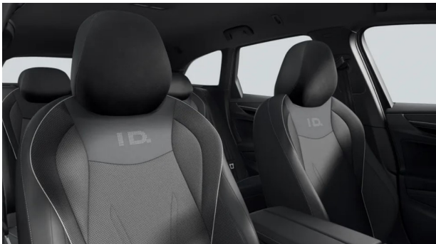
Inserts of front seats and outer rear seats in perforated ArtVelours ECO microfleece, seat bolsters in Artex Soul Black (ZO) (forces option package PBF) Optional from ID.7 PRO PLUS / PRO S PLUS