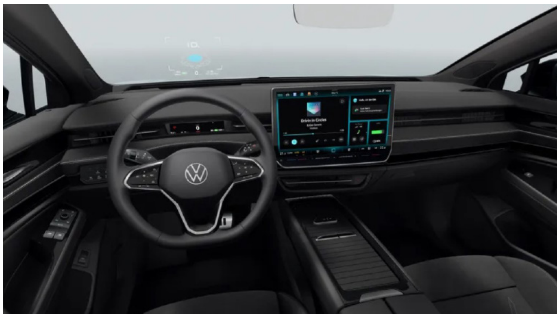
Soul Black (ZN) Standard from ID.7 PRO PLUS / PRO S PLUS