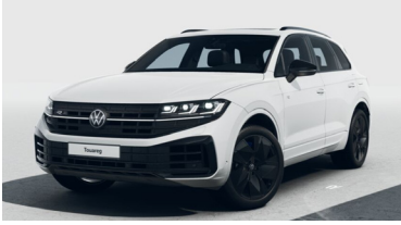
Pure White Solid