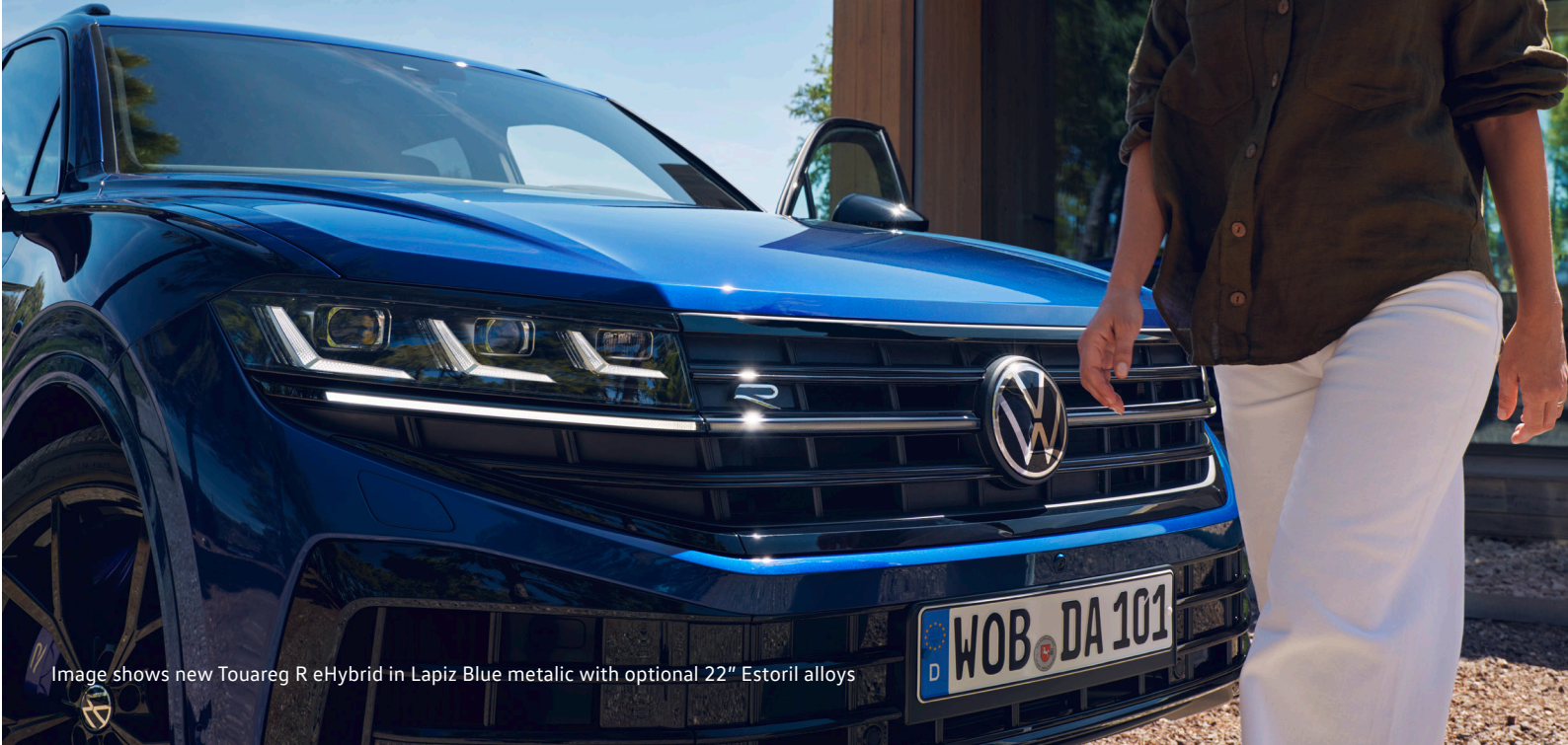
Image shows new Touareg R eHybrid in Lapiz Blue metallic with optional 22" Estoril alloys

The HD matrix headlight not only provides better visibility at night but also supports you when driving. More than 19,000 individually controllable LEDs are used for each headlight. This enables your Volkswagen to project markings onto the road, for example, when the high beam is switched on. The HD matrix headlight has a special light animation ready for you.