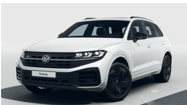
Oryx White Pearl Effect