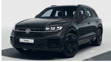
Grenadilla Black Metallic