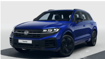
Lapiz Blue Metallic*