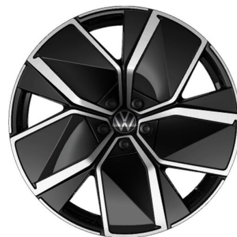
OPTIONAL ON R LINE & R EHYBRID 21" Leeds Alloys Leeds 9.5J x 21, Black, diamond-turned, tires 285/40 R21 PJ5