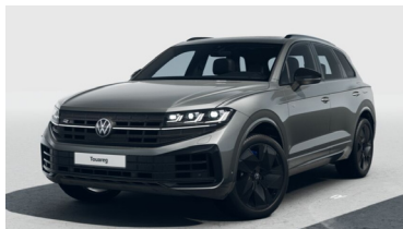
Silicon Gray Metallic