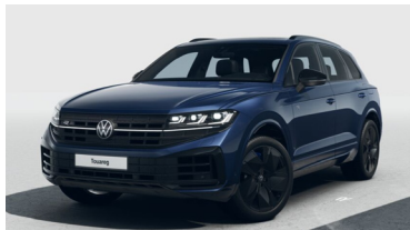
Meloe Blue Crystal Effect