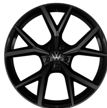
OPTIONAL ON R EHYBRID 22" Estoril Alloys 'Black' Estoril 9.5J x 22, in Black, Volkswagen R, tires 285/35 R22 PJ7

The addition of optional extras may result in the vehicle increasing in Co2 g/km and therefore, attracting a higher rate of VRT than described in this product guide. For your exact configuration value, both Co2 g/km and RRP, please visit volkswagen.ie configurator .