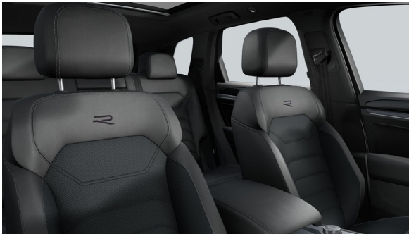
"Vienna" leather R eHybrid Soul Black - Crystal Grey