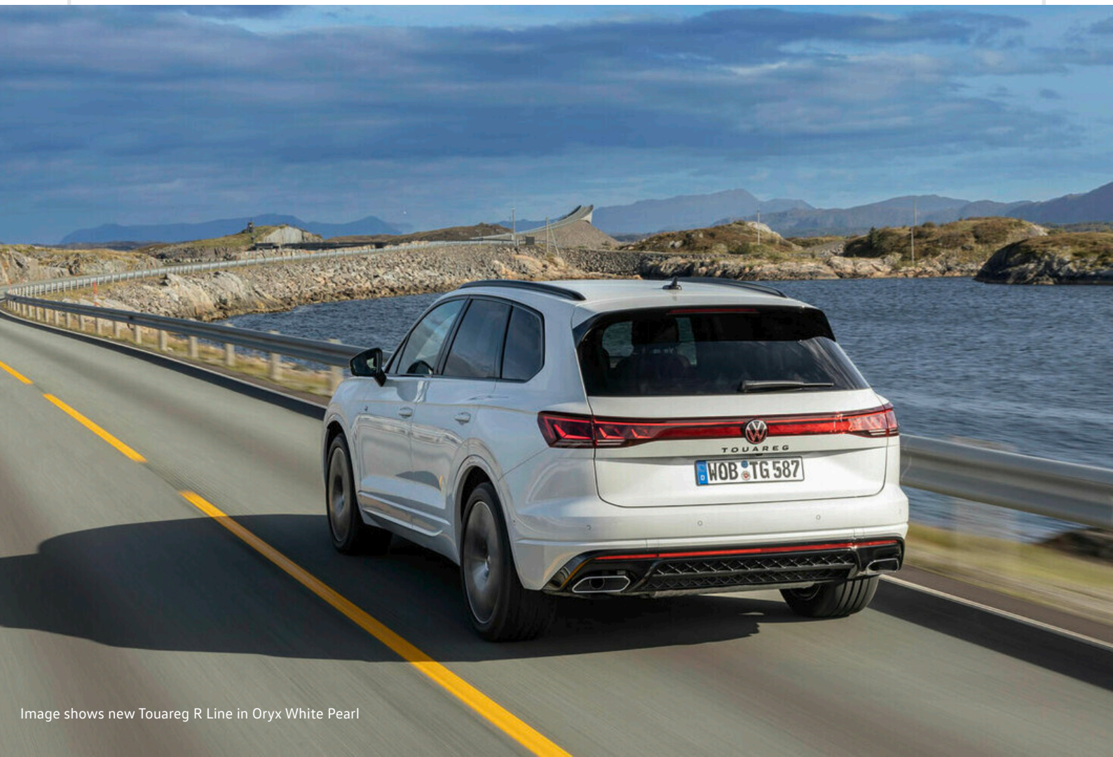
Image shows new Touareg R Line in Oryx White Pearl