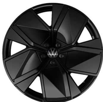
OPTIONAL ON R LINE & R EHYBRID 21" Leeds Alloys 'Black' Leeds 9.5 J x 21 in black, tires 285/40 R 21 PJ6