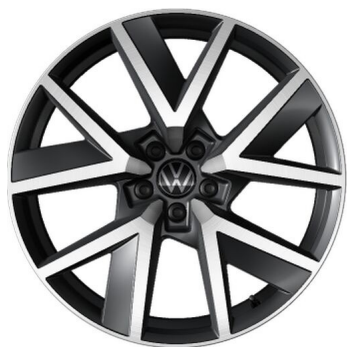
STANDARD ON R-LINE & R EHYBRID 20" 'Braga' alloy wheels, in 'Black' with diamond turned surface

The addition of optional extras may result in the vehicle increasing in Co2 g/km and therefore, attracting a higher rate of VRT than described in this product guide. For your exact configuration value, both Co2 g/km and RRP, please visit volkswagen.ie configurator .