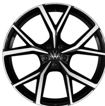
OPTIONAL ON R LINE R EHYBRID 22" Estoril Alloys 'Diamond Turned Surface' Estoril 9.5J x 22, Black, diamond-turned, Volkswagen R, tires 285/35 R22 PJ9