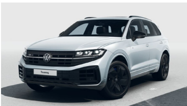
Oyster Silver Metallic