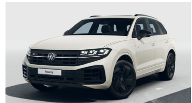
Sechura Beige Metallic