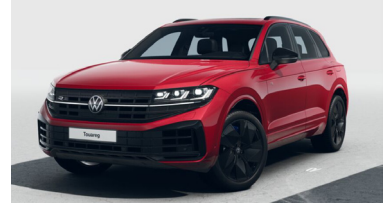
Chili Red Metallic