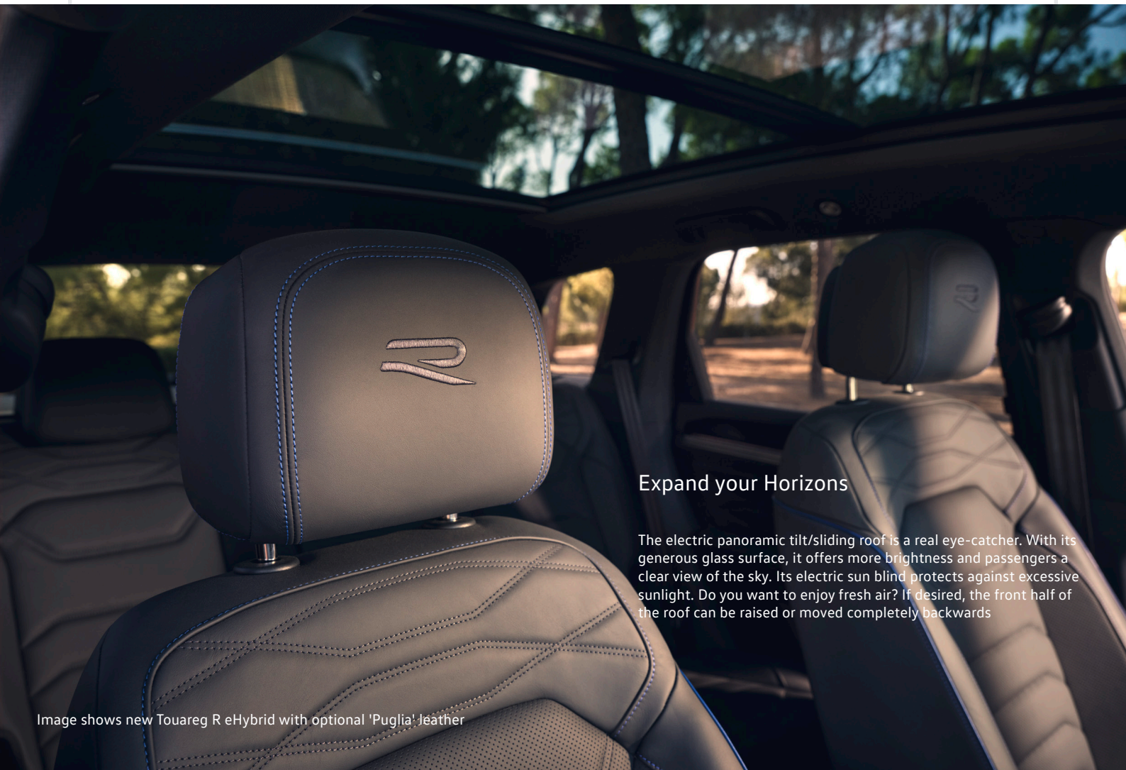
Image shows new Touareg R eHybrid with optional 'Puglia' leather

The 12" digital instrument cluster and the 15" screen of the infotainment system form one curved glass surface: the Innovision Cockpit. Operated by touch, gestures or voice control, it displays functions in graphics and animations. Home screen content can be customised and buttons can be programmed freely for favourites and shortcuts.