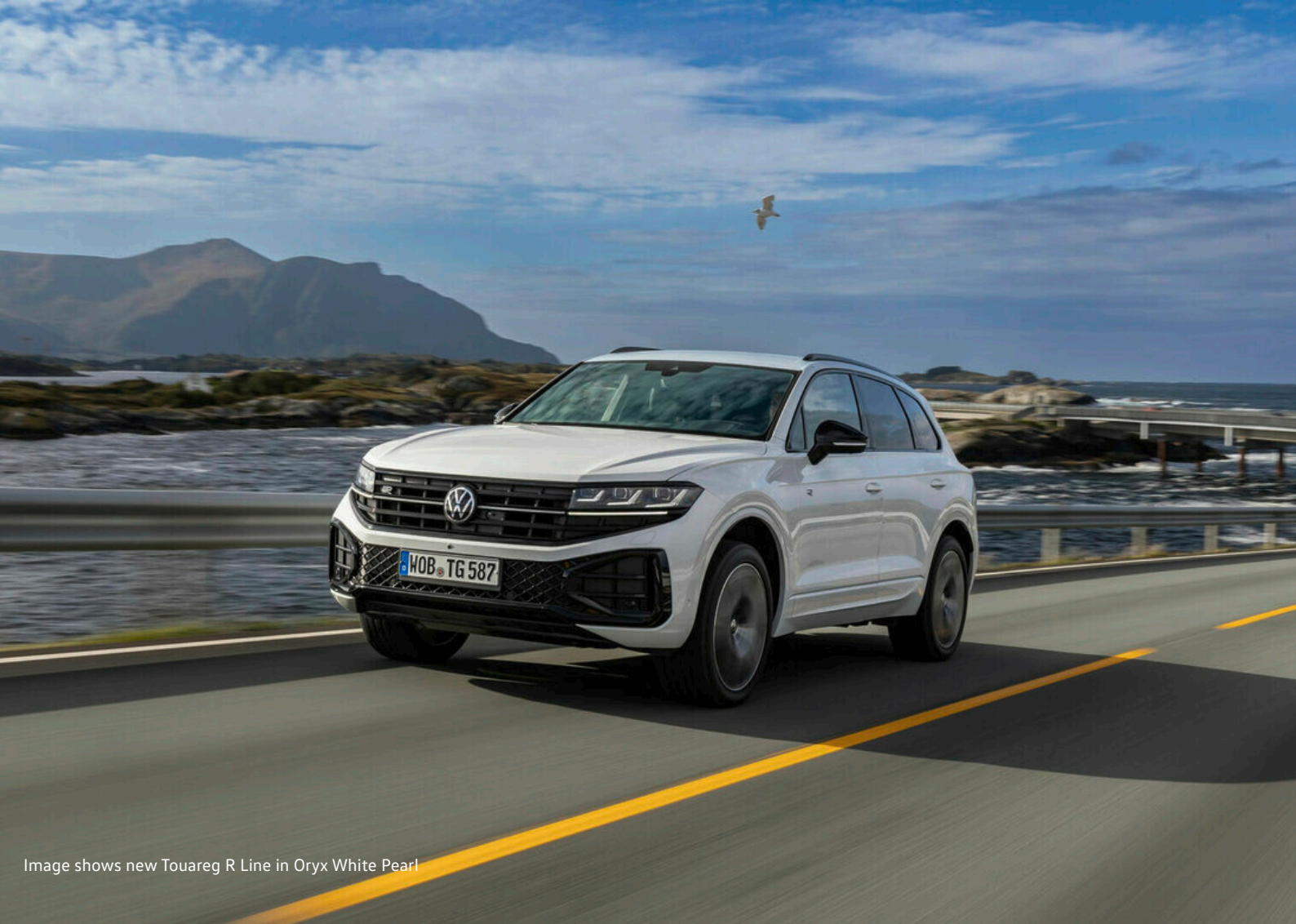
Image shows new Touareg R Line in Oryx White Pearl