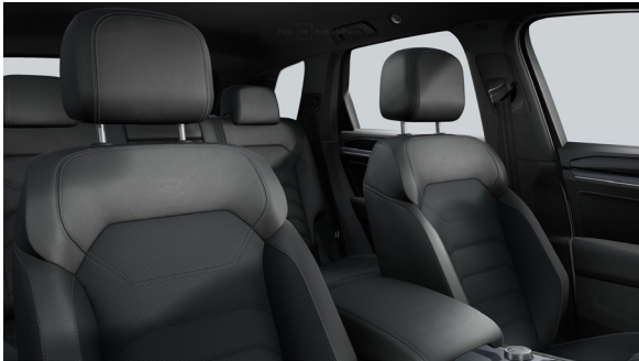
"Vienna" leather R Line Soul Black - Crystal Grey