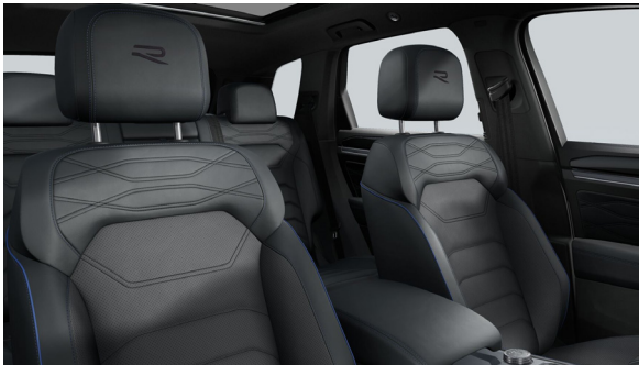
Optional "Puglia" leather Soul Black