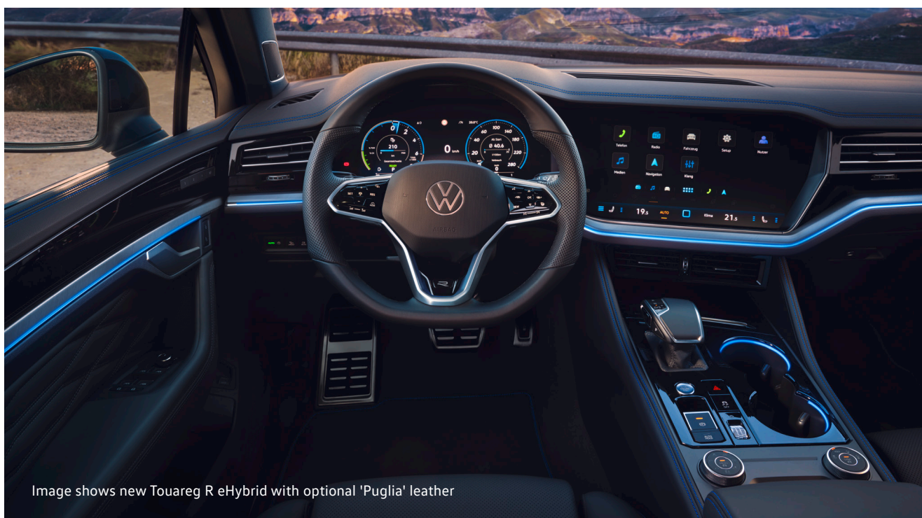
Image shows new Touareg R eHybrid with optional 'Puglia' leather