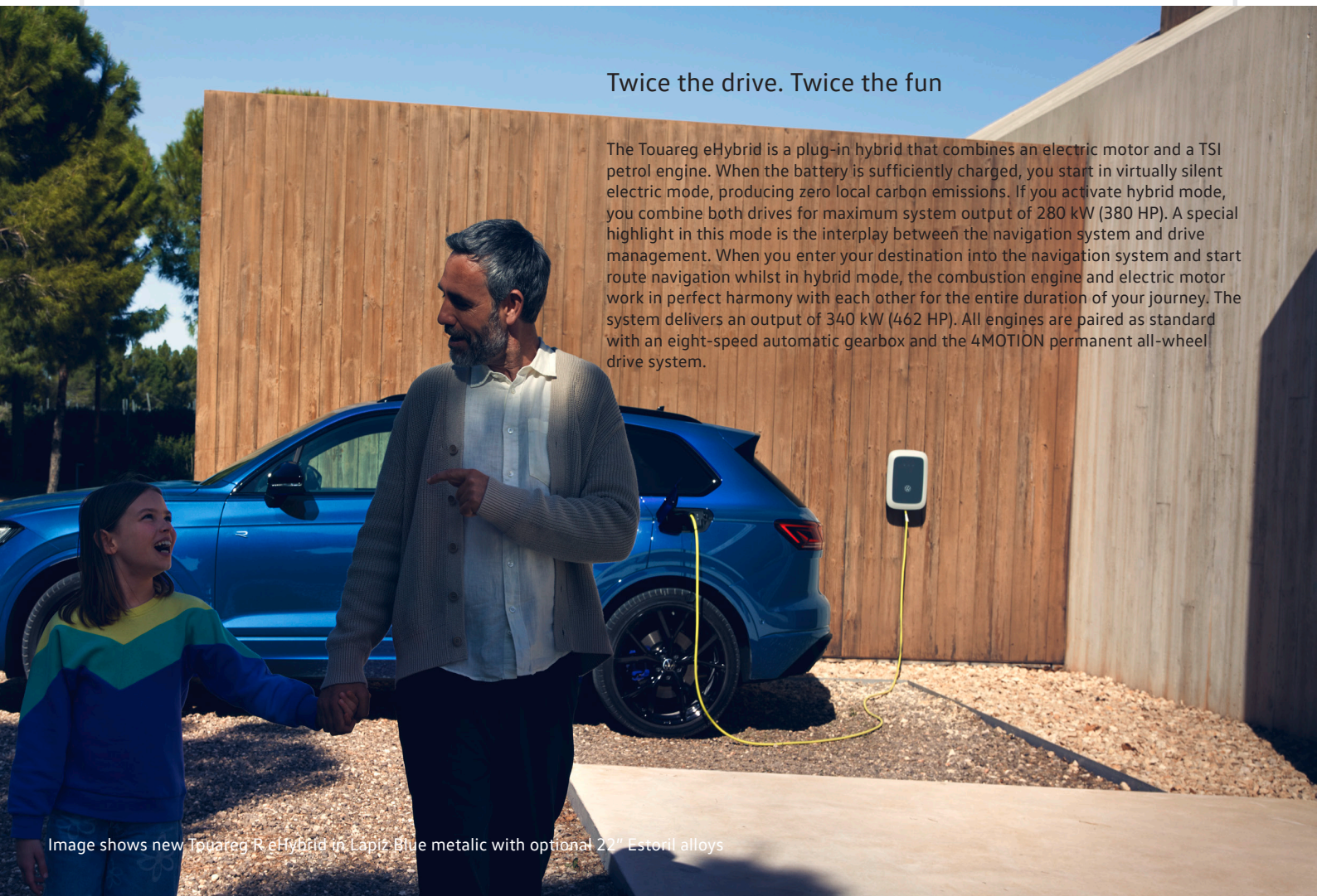
Image shows new Touareg R eHybrid in Lapiz Blue metallic with optional 22" Estoril alloys

The Touareg eHybrid is a plug-in hybrid that combines an electric motor and a TSI petrol engine. When the battery is sufficiently charged, you start in virtually silent electric mode, producing zero local carbon emissions. If you activate hybrid mode, you combine both drives for maximum system output of 280 kW (380 HP). A special highlight in this mode is the interplay between the navigation system and drive management. When you enter your destination into the navigation system and start route navigation whilst in hybrid mode, the combustion engine and electric motor work in perfect harmony with each other for the entire duration of your journey. The system delivers an output of 340 kW (462 HP). All engines are paired as standard with an eight-speed automatic gearbox and the 4MOTION permanent all-wheel drive system.