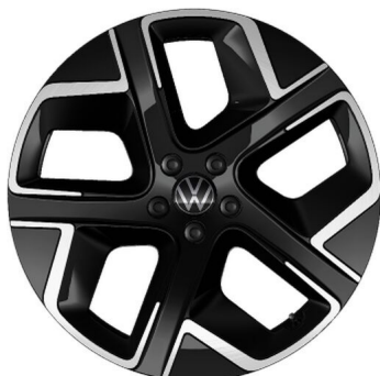
OPTIONAL ON R LINE 20" York Alloy York 9J x 20, Black, diamond-turned, tires 285/45 R20 PJ4