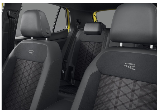
Gray - Titanium Black (WG) Standard on R-Line