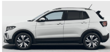
Pure White Solid *