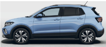
Clear Blue Metallic *