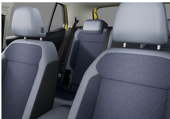
Cosmic Blue - Titanium Black (WG) Standard on Style Not available with colour Kings Red (P8P8)