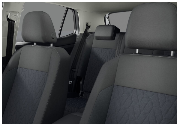
Melange Gray (QV) Standard on Life / Edition 75