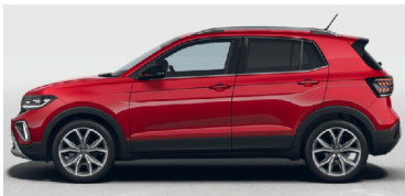
Kings Red Metallic *