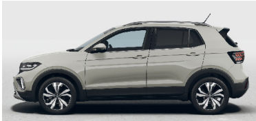
Ascot Grey Solid *