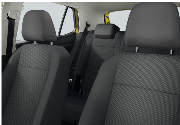
Titanium Black (EL) Standard on T-Cross