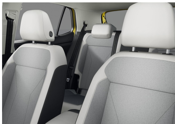
Mistral Titanium Black (SV) Optional on Style (Only with pack PAD)