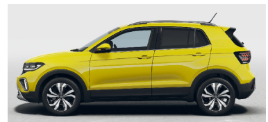
Grape Yellow Solid *