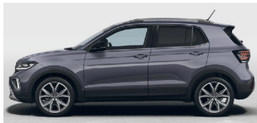
Smokey Grey Metallic *